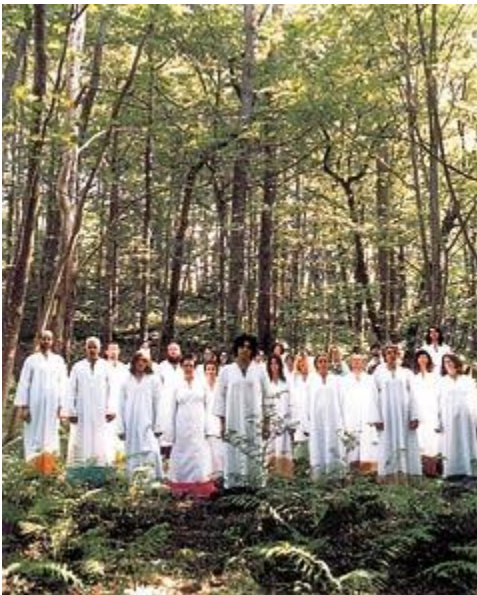
The Polyphonic Spree will open for David Bowie. They've conjured up a new sonic mixture of rock opera, pseudo-religious spectacle, and pure theater.

He then abruptly looks downward, muttering "I promise I have forgotten the deal we made." After a well-placed, dramatic pause, he busts out with a big, laugh.